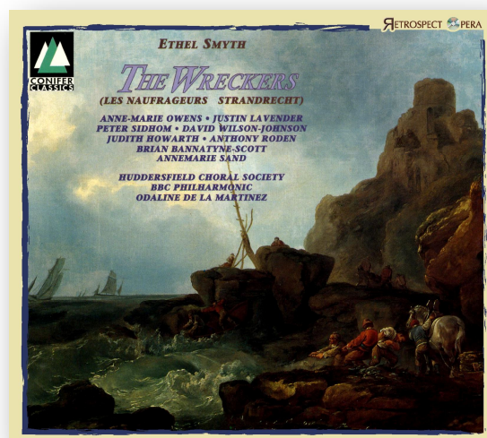
CD cover of the re-release of The Wreckers