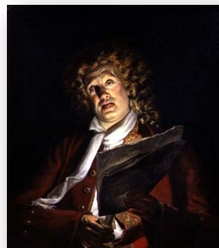
Charles Dibdin, by Arthur William Devis

As composer and librettist, Dibdin was one of the most significant writers of English comic opera and song in the late eighteenth and early nineteenth centuries. He was also highly respected as a versatile performer on the London stage.