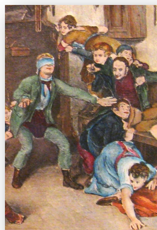
A detail from 'Blind Man's Buff', by David Wilkie, 1812

While many of these "Table Entertainments" are sadly now lost to history, Christmas Gambols (1795) has survived more or less intact. It was intended specifically as a Christmas show, replete with reference to festive traditions, and features songs in a range of different styles.